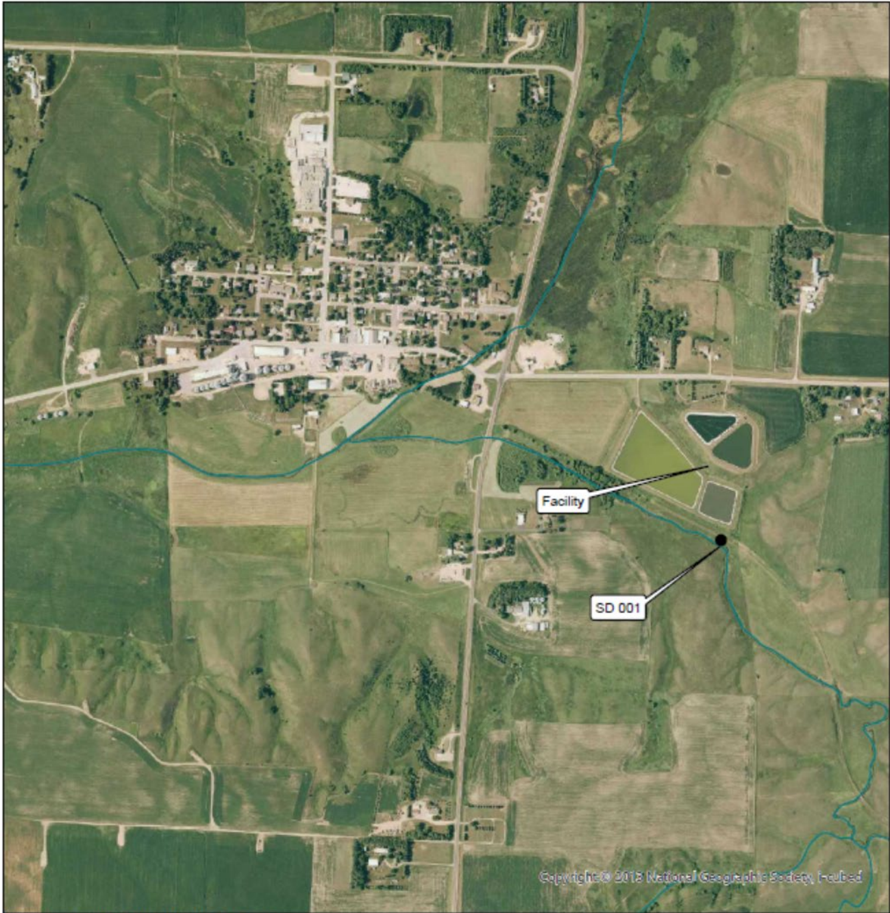
Map produced by: MPCA Staff, 3/31/2026 Scale: 1:12,000

Facility Location Map MN0039748: Chandler Wastewater Treatment Facility T105N, R42W, Section 6 Fenton Township, Murray County, Minnesota